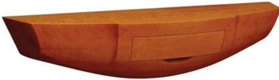
Bow Shelf, Australian Lacewood, 10" x 42" x 10"

As a businessman before an artist, I bring a unique perspective to my studio paradigm. I believe in meticulous planning and tracking, which is reflected in my creative process for new work. It starts with pencil and paper plus full-scale drawings, and I often make a maquette of the piece.