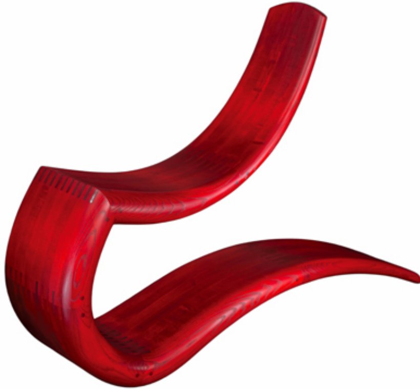
Caitlin's Nymph Bench, Ash stained Red, 31.5" x 45" x 12.5"

Every process step is planned, tracked, and priced in an MS Excel spreadsheet. This business-like approach ensures that I stay organized and focused, allowing me to bring my artistic vision to life.