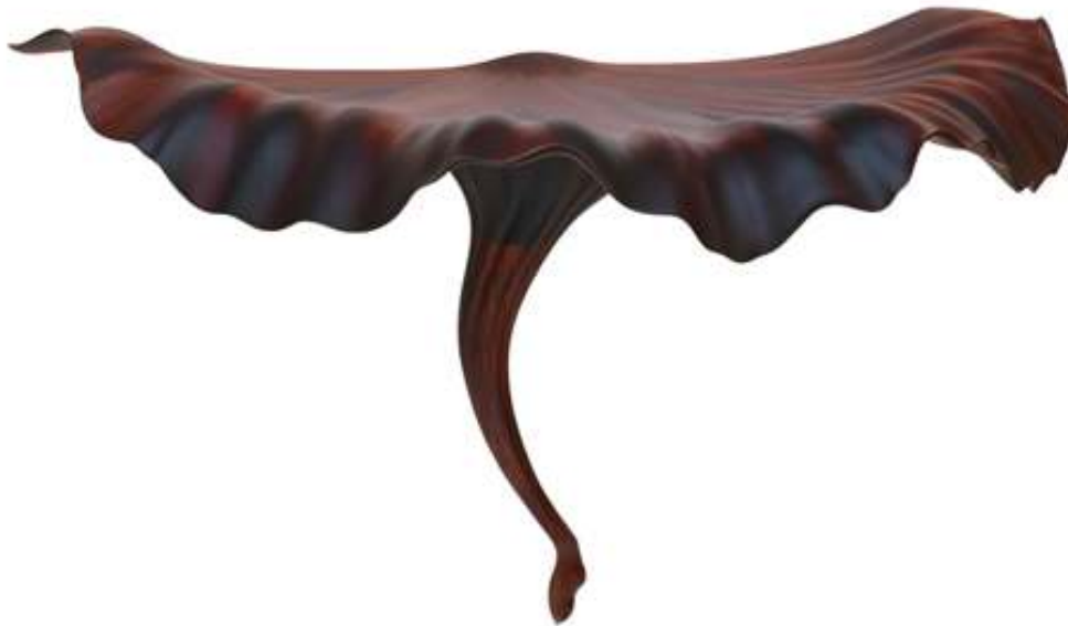
Sapele Flower Petal Shelf, African Sapele, 34" x 55" x 28"

As a businessman before an artist, I bring a unique perspective to my studio paradigm. I believe in meticulous planning and tracking, which is reflected in my creative process for new work. It starts with pencil and paper plus full-scale drawings, and I often make a maquette of the piece.