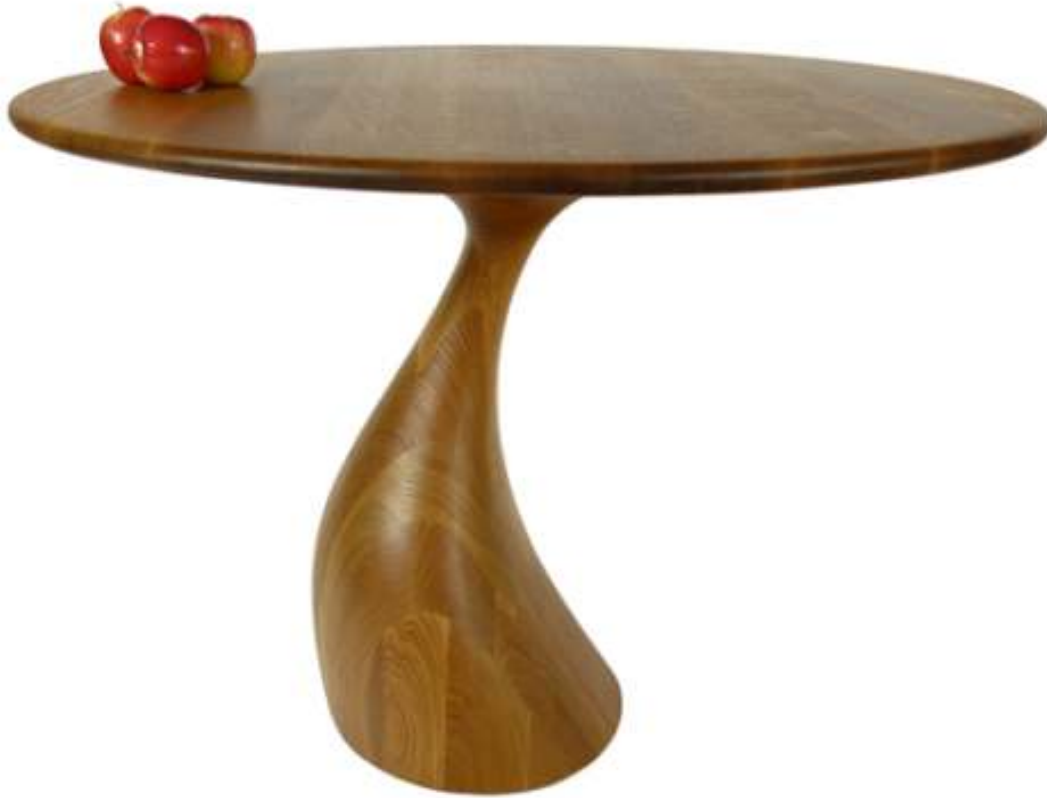
Café Dining Table, White Oak, 30" x 40" x 40"