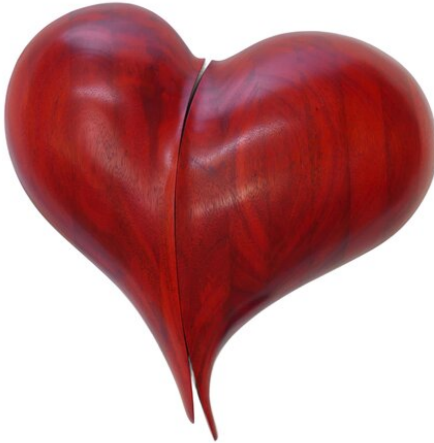
Blended Heart, Ash stained Red, 19 ½" x 20" x 4"

After completion, I often find it difficult to immediately determine if I'm satisfied with the piece. The creative process can be a smooth flow or a battle. But it's only when I see the piece later, at a collector's home or an exhibition, that I can truly judge the work.