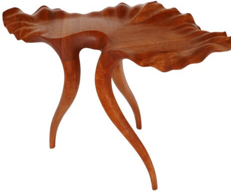
Allegretto Leaf Hall Table, Cherry, 33" x 52" x 32"

My journey from rural Ohio to the art world was not a childhood dream but a gradual evolution. I discovered joy in creating things, and this simple pleasure eventually led me to a path I never thought I would tread—the art world.