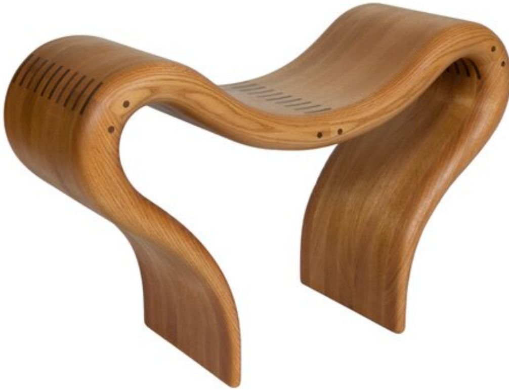
Boopsie Bench, White Oak, 20.75" x 32.5" x 11.5"

At art school, I began to see the importance of all the chores my parents had me do in the orchard. The discipline and patience I learned from maintaining the fruit trees translated into my art. My sculpture and furniture naturally evolved from those bushels of apples, pears, and the mountains of raked leaves.