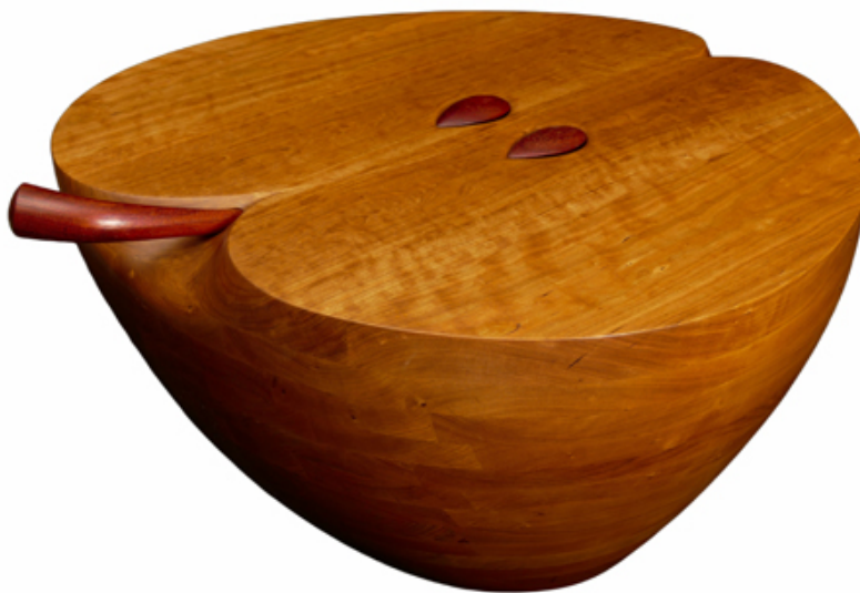
Johnny Apple Seed Coffee Table, Cherry and African Padauk, 17" x 32.75" x 30.5"

My journey from rural Ohio to the art world was not a childhood dream but a gradual evolution. I discovered joy in creating things, and this simple pleasure eventually led me to a path I never thought I would tread—the art world.